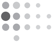
Figure 2: Illicit drug use at the global level, late 1990s–2010/11